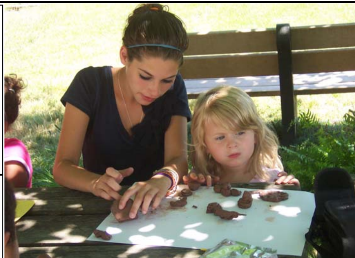
Staff and students crafted pottery during Oakwood's Summer Youth Art Drop In program.

The Golf Outing will be held September 24 th at States Golf Course with a shotgun start at 9am. States Golf Course, an 178 hole, par 72, 6272 yard course with a full service restaurant and a bar located at 20 E. West Street, Vicksburg, phone 649-1931, is providing a benefit rate of $45/round for 18 holes and lunch, as well as prizes at the door, 50/50 for closest to hole, and 4 rounds of golf to lucky winners. Contact benefit organizer Colette Johns at 626-8024 to register.