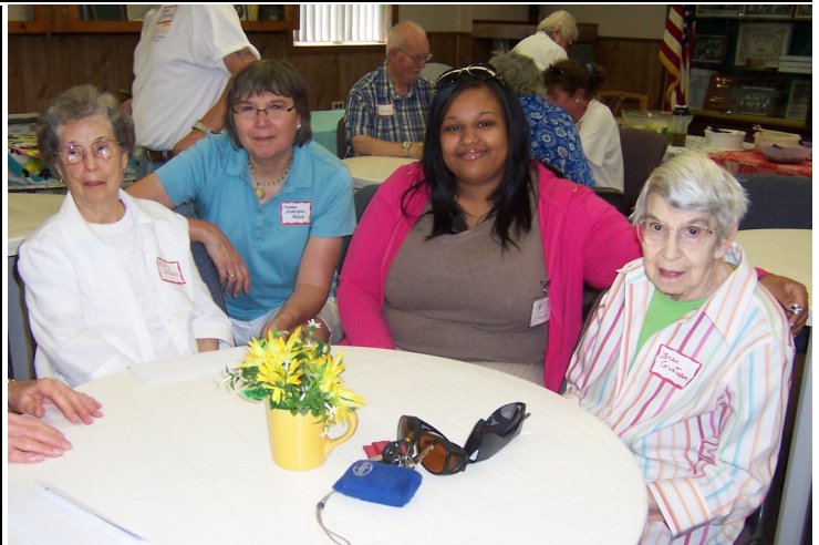
Current and former neighborhood residents gathered for the annual Oakwood Reunion. Friends came from next door and as far away as Florida and Arizona for a record-breaking attendance!

Make sure you get outside and enjoy many of the neighborhood's green spaces, including the Oakwood Memorial Beach, the Springmont Tot Lot, and the Oakwood Community Garden. These are YOUR spaces, so take advantage of them before the summer flies by!