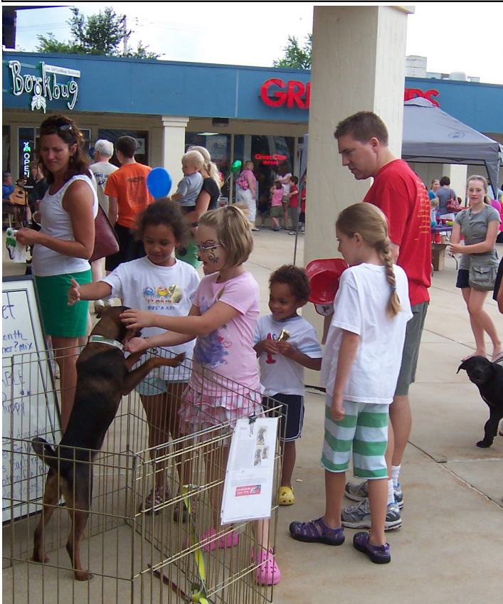
People and pets gathered at the Oakwood Summer Hop, sponsored by area businesses.

This Day of Service combines the observance of the 9/11 National Day of Service and Remembrance with the efforts of the Kalamazoo Neighborhood Safety Initiative to engage volunteers of all ages in positive change in our neighborhoods and organizations. We are in the planning stages to make the upcoming Day of Service the best one yet for our community. Mark your calendar and plan to join us! Further details and online registration will be available soon at www.volunteerkalamazoo.org .