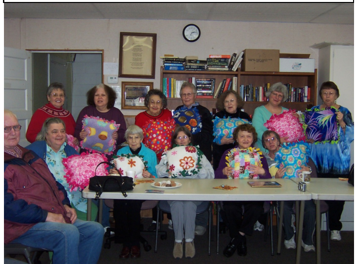
The seniors with pillows they created during the senior craft day.