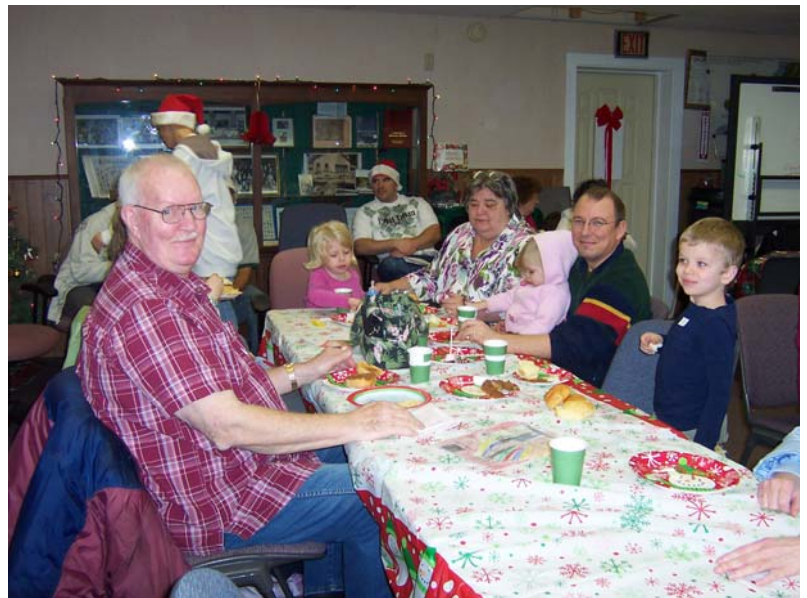
Neighbors visiting at the Holiday Party

To earn 2% of your purchase for Oakwood Neighborhood Association