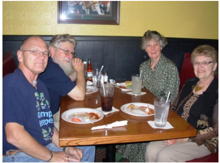
ONA Volunteers gathered at Fletcher's Pub in October.

Interested in receiving the Oakwood Times newsletter electronically? To sign up, please send your email address to editor@oakwoodneighborhood.org .